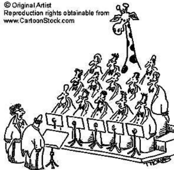
"He's here to hit the high notes."

© Original Artist Reproduction rights obtainable from www.CartoonStock.com